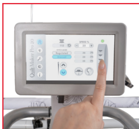
7" Digital LCD Touchscreen Displays