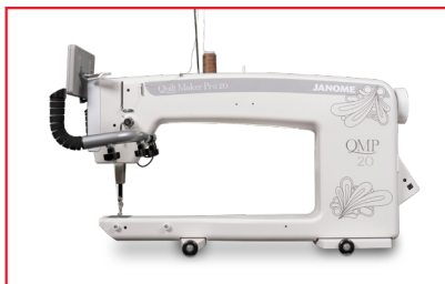
20" Machine Arm